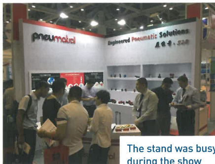
The stand was busy during the show

Lancashire-based specialist manufacturer Pneumatrol Limited has recently showcased its products at Valve World Expo Asia 2015 , which was held on September 23 and 24 in the Suzhou International Expo Center in Suzhou, China.