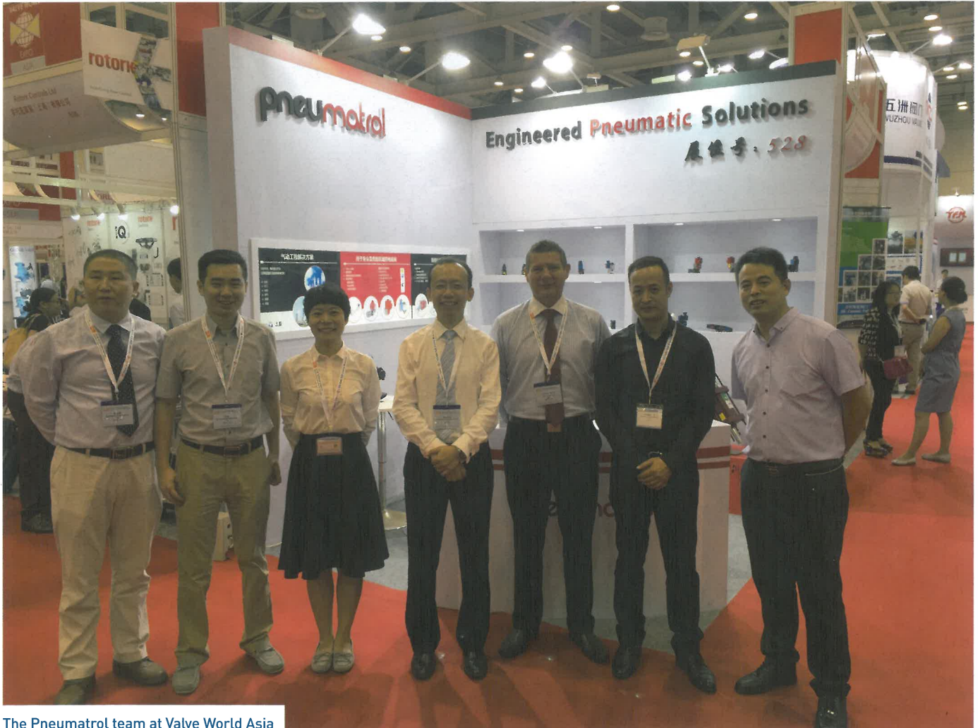
The Pneumatrol team at Valve World Asia

Lancashire-based specialist manufacturer Pneumatrol Limited has recently showcased its products at Valve World Expo Asia 2015 , which was held on September 23 and 24 in the Suzhou International Expo Center in Suzhou, China.